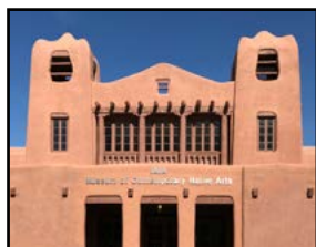
Museum of Contemporary Native Arts (MoCNA)

Please join colleagues following the lunch for a walking tour of the IAIA Museum of Contemporary Native Arts (MoCNA) in a docent-led tour of current museum exhibitions. MoCNA is dedicated to increasing public understanding and appreciation of contemporary Native art, history and culture through presentation, collection and acquisition, preservation and interpretation. MoCNA is recognized as the preeminent organizer of exhibitions devoted exclusively to the display of dynamic and diverse arts practices representative of Native North America. MoCNA encourages creative expression across the fields of arts and culture as an opportunity to engage, establish, foster and cultivate cross-cultural dialogue with communities at the local, national and global level. MoCNA's exhibitions, programs, and its Collection of Contemporary Native Arts are integral to the nurturing and growth of the IAIA legacy, college community and curriculum across academic and artistic disciplines.