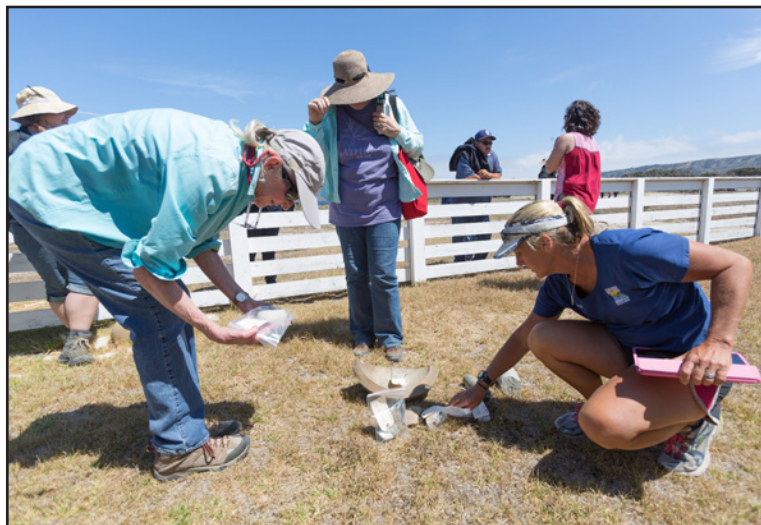
California State University Channel Islands faculty and students participate in a project at the Santa Rosa Island Research Station. More information about this partnership can be found on page 14.

Presidents must address those potential concerns directly. An initial announcement about the partnership, while crucial, is not sufficient in and of itself. Campus memories about the purposes and scope of the partnership may be prone to evaporate shortly after the initial press release. Rather, continual communication about the partnership, disseminated regularly and sent broadly across stakeholder audiences, is essential. It may seem elemental, but it is up to the president to frame why the partnership was formed, to outline the benefits that the partnership will bring to the institution, and to communicate those goals regularly, along with updates about the partnership’s progress. Presidents need to make a point of making themselves available to regularly communicate about the partnership. Consistent communications about the partnership and regular updates about its progress can pay significant dividends in diffusing potential criticism and, moreover, can help the entire campus community understand the benefits that the university can accrue from the partnership.