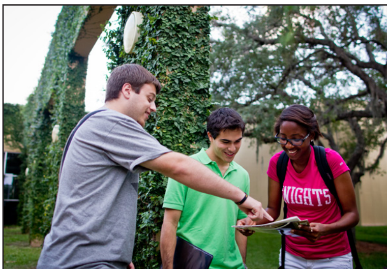
Students explore the University of Central Florida’s (UCF) campus. See page 20 to learn more about UCF, known as “America’s Partnership University.”