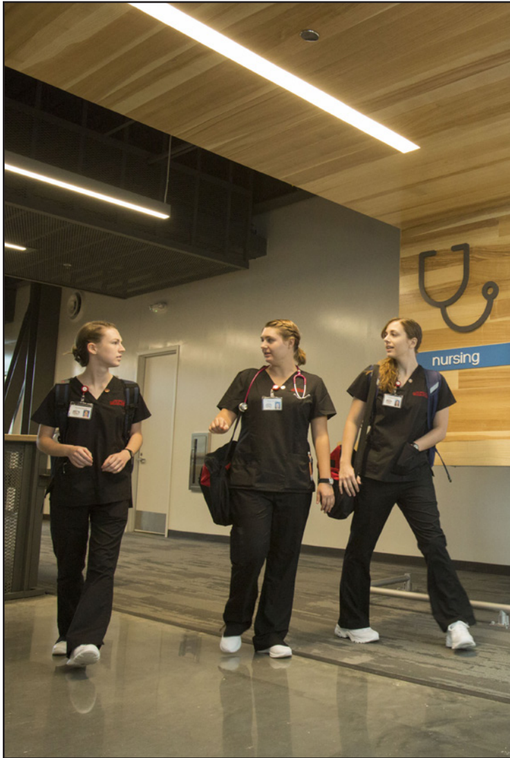
Nursing students participate in a program offered at the Missouri Innovation Campus. More information about this partnership can be found on page 12.

Part of developing a partnership, therefore, is developing a strategy for communicating about it to all who need to know about it. A related consideration is that transparency about the operation is critical to developing and sustaining a strong partnership. Further, transparent communications can serve to counter potential criticisms of the partnership. Apart from press releases and other standard channels, a university may want to develop a section of its website that is solely devoted to its partnerships. Similarly, it might want to use social media to get the word out. It is up to the president to see that messaging about partnerships and the university's engagement in partnerships is delivered regularly and consistently. It is worth adding that ongoing communication about partnerships is essential in helping an institution as a whole learn about the value partnerships can engender, and is an important strategy in developing an institutional culture that nurtures and supports partnerships.