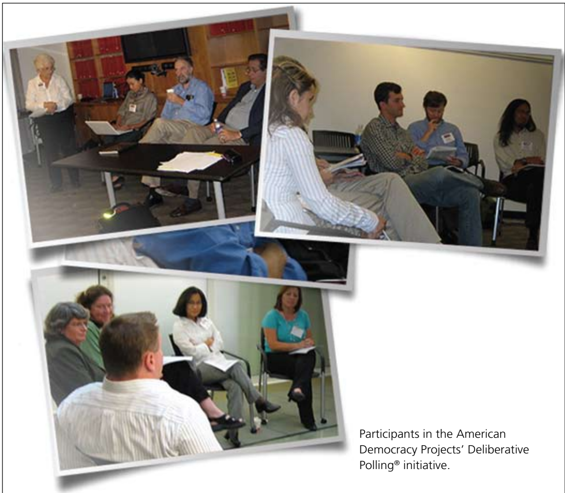
Participants in the American Democracy Projects' Deliberative Polling® initiative.

The Deliberative Polling® initiative held its second training institute at Stanford University in September. Deliberative Polling® employs social science to see what people would think about an issue if they became more engaged and informed.