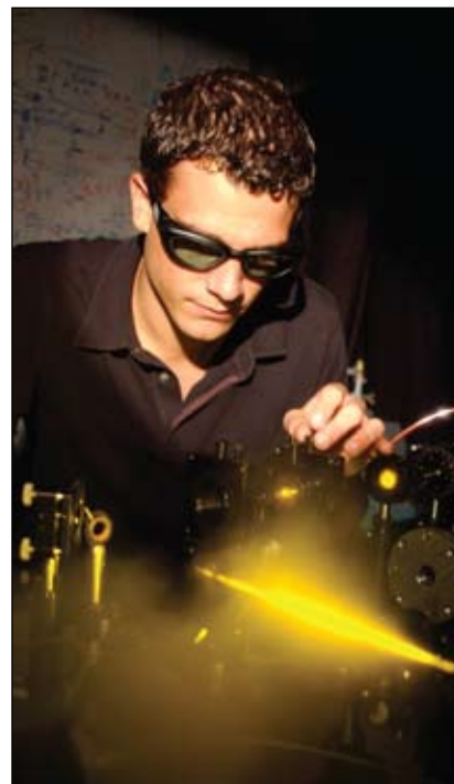
University of Central Florida student in the university's Center for Research and Education in Optics and Lasers.